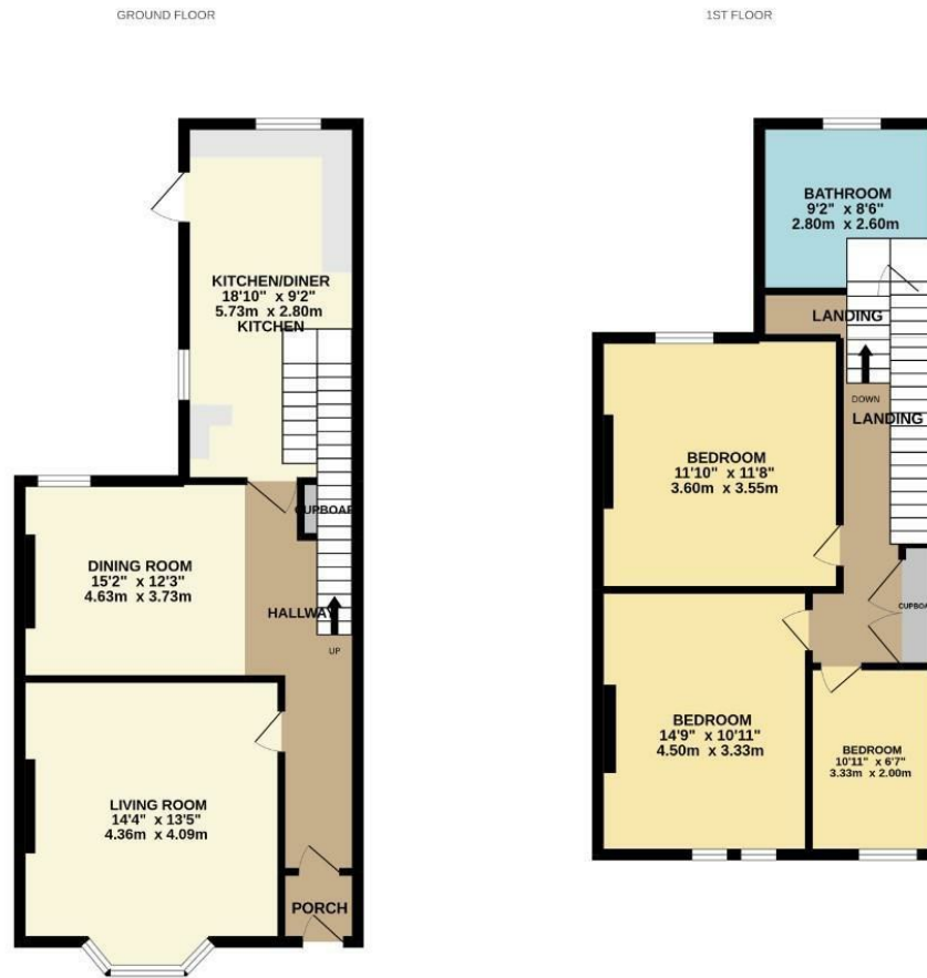
LINDISFARNE TERRACE, NORTH SHIELDS

Whilst every attempt has been made to ensure the accuracy of the floorplan contained here, measurements of doors, windows, rooms and any other items are approximate and no responsibility is taken for any error, omission or mis-statement. This plan is for illustrative purposes only and should be used as such by only prospective purchasers. The services, systems and appliances shown have not been tested and no guarantee is given as to their operability or efficiency can be given. Made with Metropix ©2022